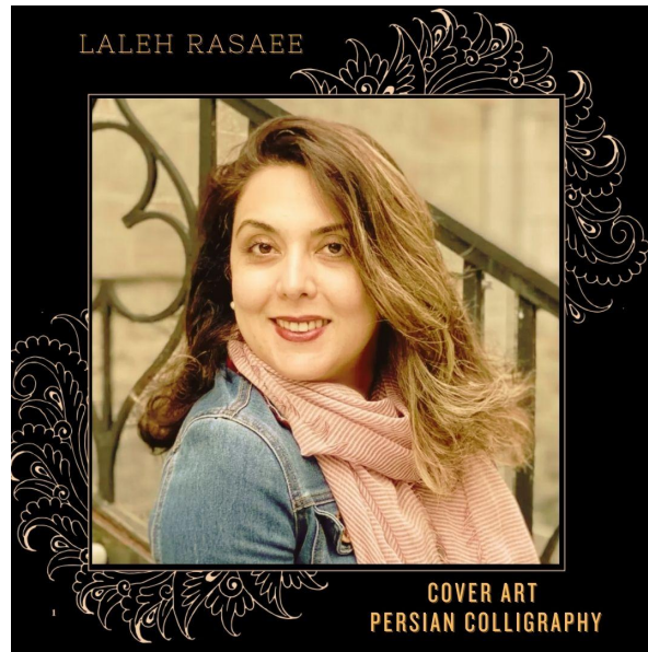
Laleh Rasaei: Cover Art Persian Calligraphy